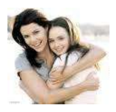
Q20. Identify this ever-popular "Maa".

Q19. Identify this TV soap which is based on a mother-daughter relationship.